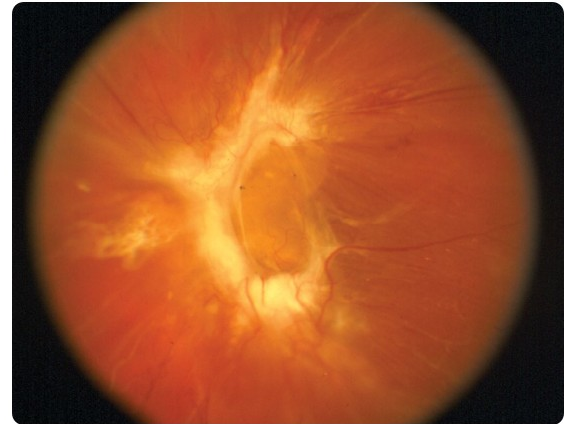
Traction retinal detachment

PDR is very serious, and can steal both your central and peripheral (side) vision.