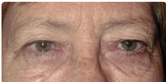
Too much eyelid skin can feel heavy and limit vision.

Ophthalmologists can remove excess eyelid skin in a procedure called blepharoplasty. At the same time, the surgeon may also remove extra fatty tissue near the eyelid or tighten muscles and tissue. This surgery helps make the area around the eye and lid look more clearly defined. It also makes eyes appear less tired and more alert.