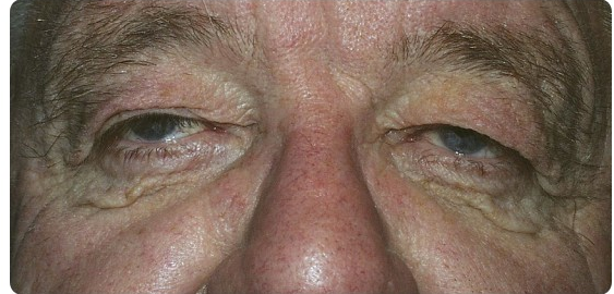
With ptosis, the upper eyelid droops.

Having an eyelid problem can be painful, limit your vision and affect your appearance. Many people have eyelid problems. They may include droopy upper eyelids, extra eyelid skin or eyelids that turn inward or outward. Fortunately, ophthalmologists can treat many types of eyelid problems with surgery.